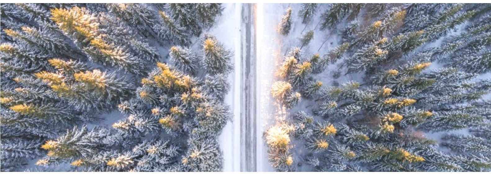
TABLE OF CONTENTS / 本期内容