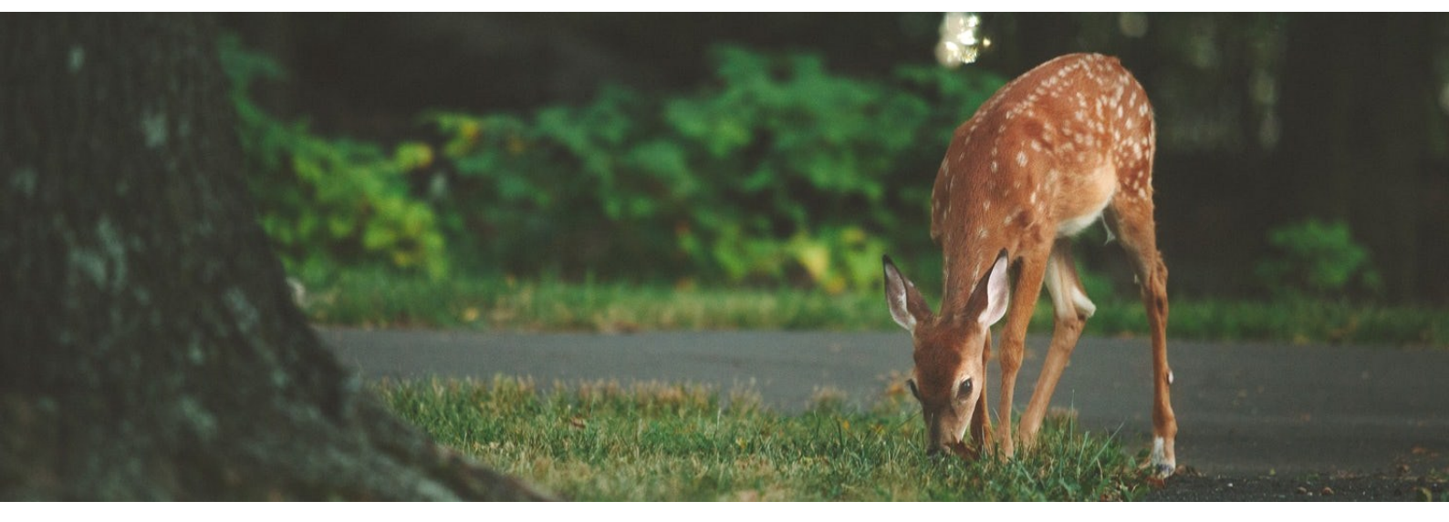
TABLE OF CONTENTS / 本期内容